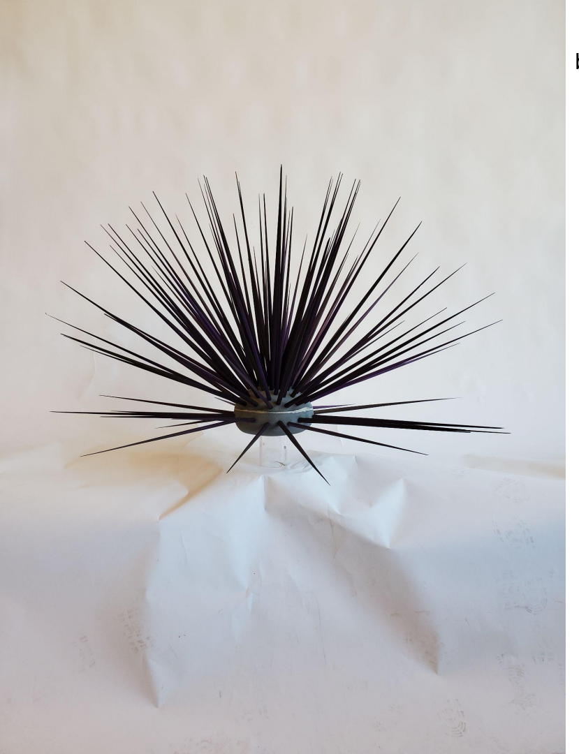
untitled (sea urchin) 2022 blue limestone, poplar, leather dye, grout 10'x5'x10' [overpopulated CA urchin species]