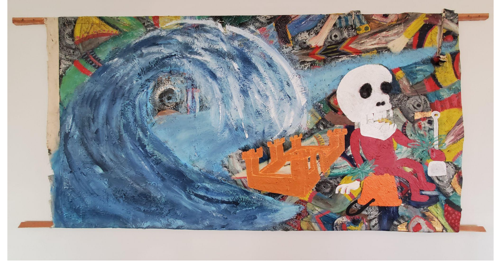
"Quick Momma, Look What I Made", 2022

found canvas, wood, staples, nails, charcoal and recycled paint 52" x 84"