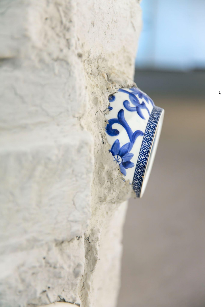
Details from Inheritance محراب عناکب